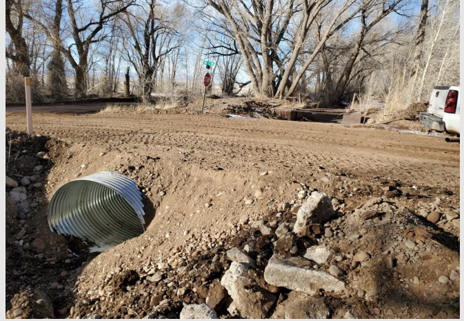
Culvert Replacement on Roads 12 & M