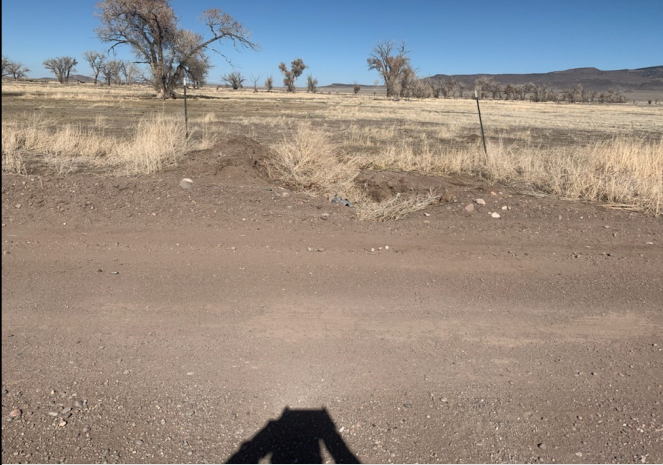
Culvert Replacement on Road G.5, east of Antonito